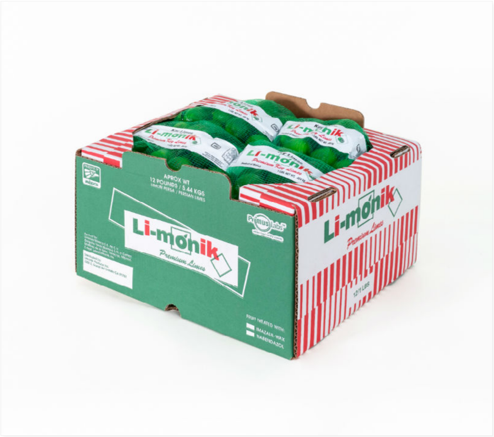
Open Top Corrugated Carton